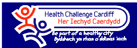
white tagline to go on dark coloured documents